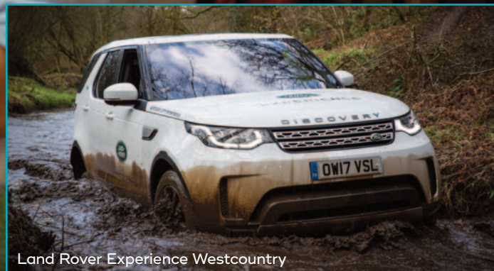
Land Rover Experience Westcountry