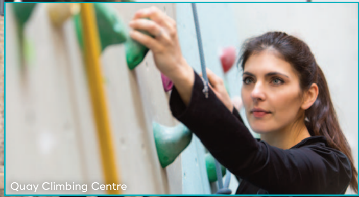
Quay Climbing Centre