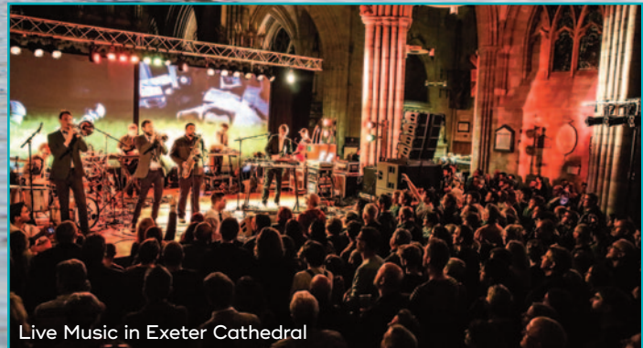
Live Music in Exeter Cathedral